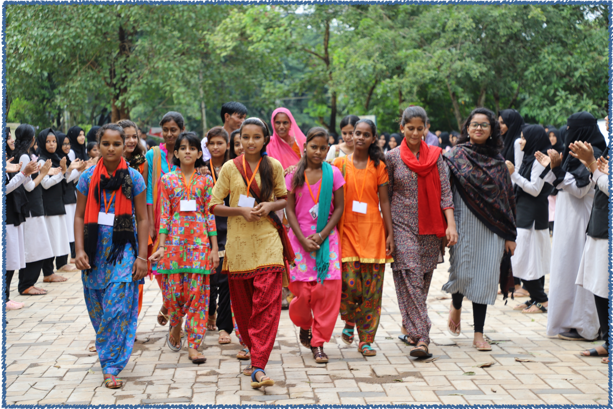
SMILE Interns from Manthan Sikshak Santhan, Kotri, Rajasthan, being welcomed to Sullamussalam Science College by the NSS Volunteers