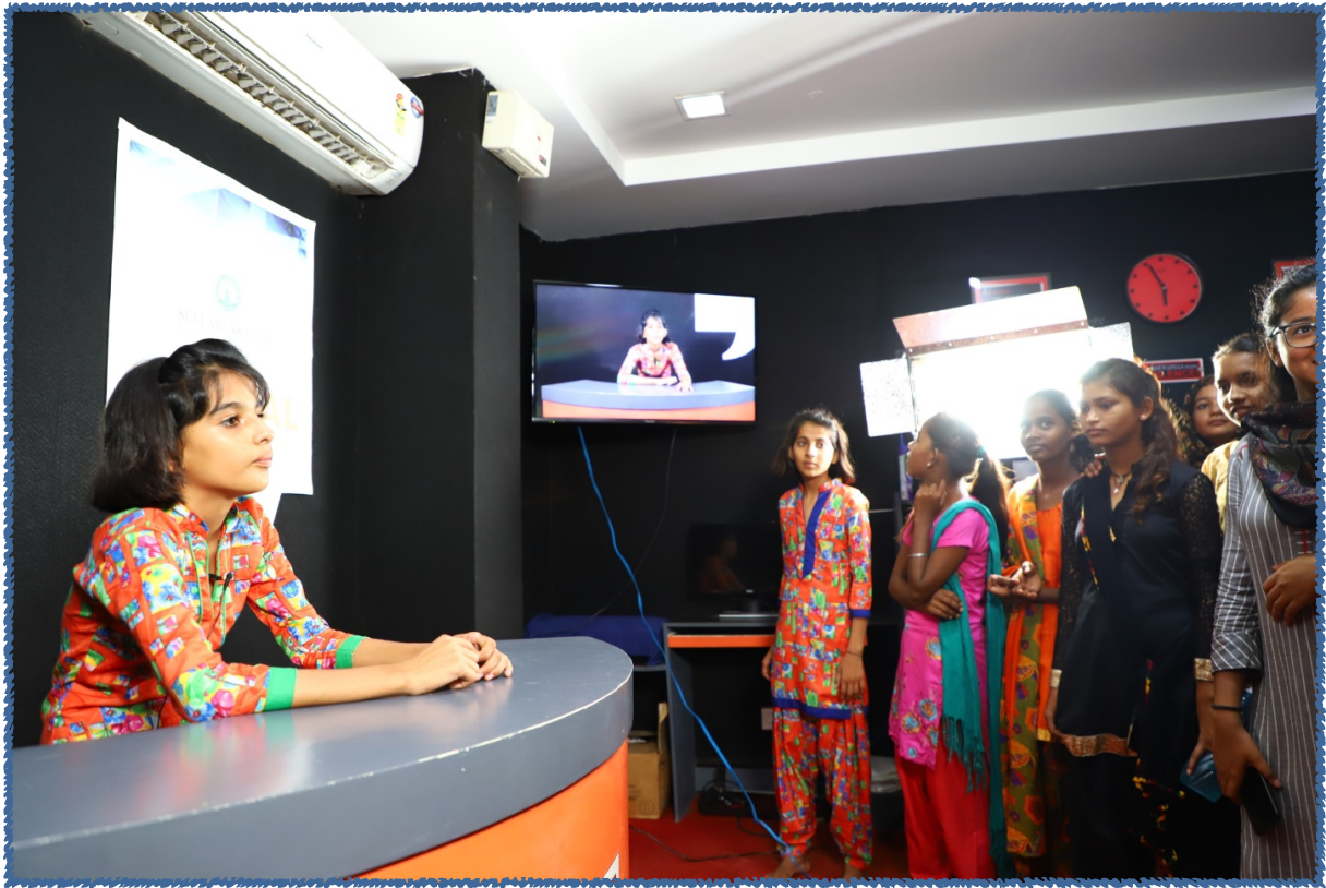
SMILE Interns from Manthan Sikshak Santhan at the Media Centre of Sullamussalam Science College, Areekode