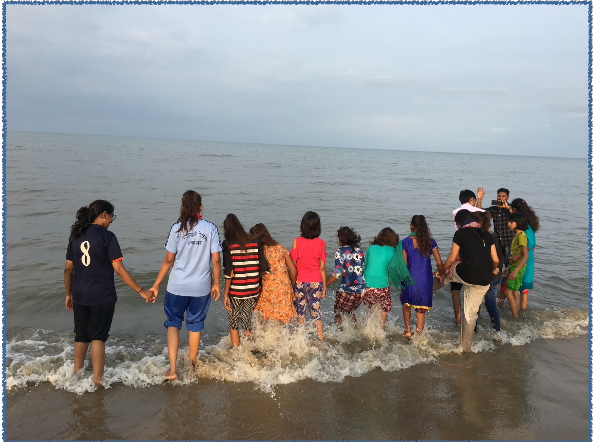
SMILE Interns from Manthan Sikshak Santhan visiting the Calicut Beach.