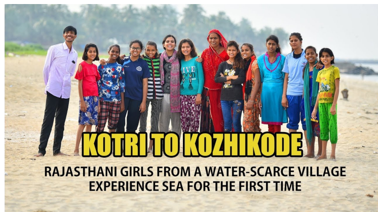
KOTRI TO KOZHIKODE RAJASTHANI GIRLS FROM A WATER-SCARCE VILLAGE EXPERIENCE SEA FOR THE FIRST TIME

Kotri to Kozhikode: A documentary by The Week on the SMILE 2.0 jointly organised by Sullamussalam Science College, Areekode, and Manthan Sikshak Sansthan, Kotri, Rajasthan