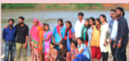
Manthan students visiting River Chalyar

Designed as a national cultural exchange programme, the SMILE project was launched last year and 11 students and two staff from Sullamussalam Science College had spent 10 days in Rajasthan villages exploring their culture and observing socio-economic conditions there.