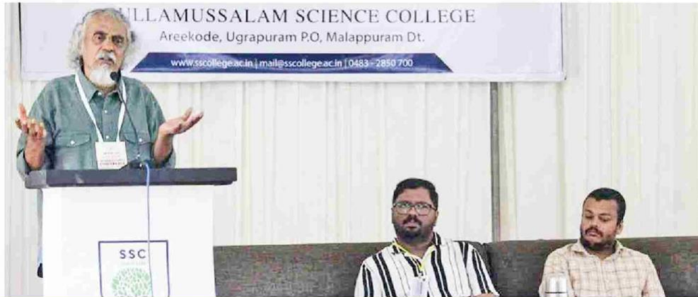
16/02/2024 | MALAPPURAM | Page : 18